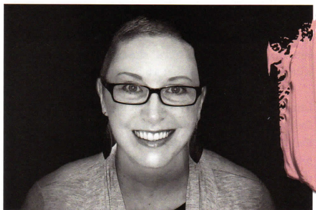
Norton on the day she finished radiation therapy.

She began chemotherapy in January 2018, then underwent radiation—which left her with painful second-degree burns covering her rib cage—in May and