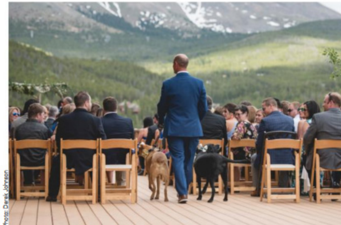
Pups can be part of the wedding ceremony at The Lodge at Breckenridge