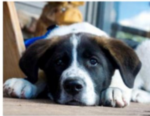
Sundance Trail Guest Ranch

1300 Westhaven Dr. Vail, CO 81657 970-476-1234 hyatt.com