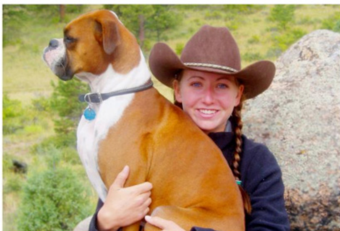
You can bring your dog or your horse to Sundance Trail Guest Ranch in Red Feather Lakes

Be sure to mention your pet and confirm pet policies when you make reservations.