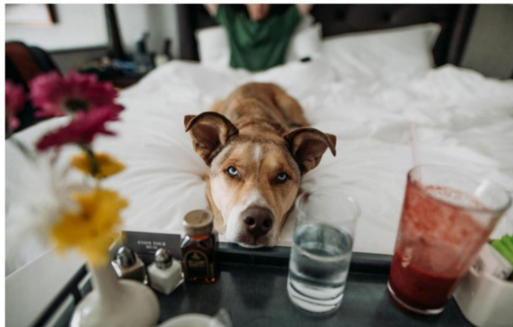
In addition to room service for the human guests, Grand Hyatt Vail offers Yappy Hour for pooches