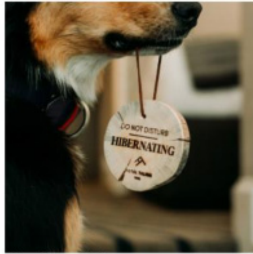
Grand Hyatt Vail

Party animals will love the summertime “Yappy Hours” on Thursdays on a stunning outdoor terrace at Grand Hyatt Vail, with live music, appetizers, full bar—and special beef-flavored “beer” for canine guests. They can enjoy the “Pup Pampering Menu” for in-room dining, featuring salmon,