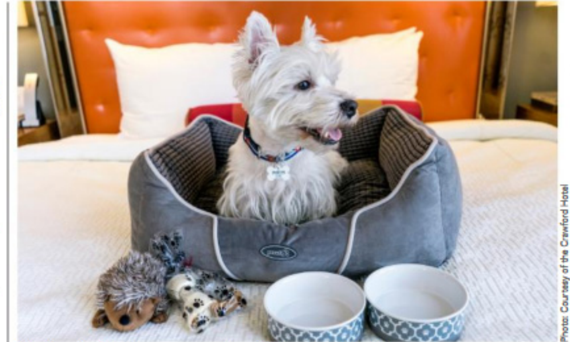
The Crawford Hotel pampers pooches with turndown biscuits, chew toys and a custom dog tag

The 40-mile Eagle River Trail runs directly in front of The Westin Riverfront Resort & Spa, Avon for canine adventures. Later, pooped pooches can nap on Westin Heaven Dog Beds. Dogs only, $75/night, no weight restrictions